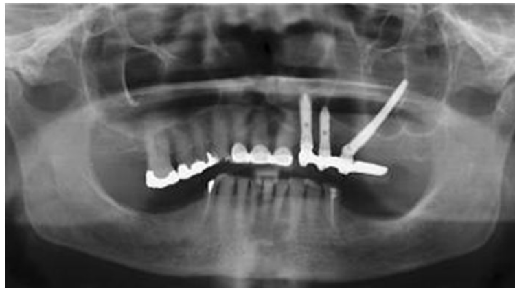
Figure 8: Panoramic radiograph 12 month post-surgery

In the control at 12 month post-surgery we take a panoramic radiograph, and we can see the optimal bone-implants healing and osseointegration with the final prosthesis, and with any problem, all the treatment its stable and with good results (Figure 8).