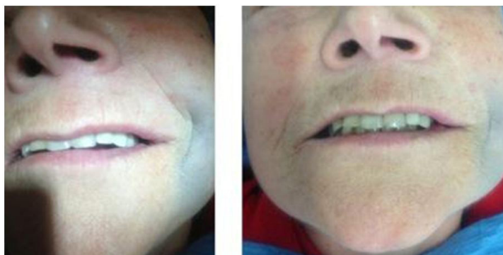
Figure 7: Clinical pictures post-operative 7 days after

The patient came to the clinic at 7 days for adjustment of the immediate loading prosthesis and removal of the sutures, without presenting greater signs of inflammation and with a fairly rapid recovery (Figure 7).