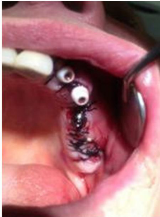
Figure 5: Clinical picture of multiunit abutments placed and sutures

When a good insertion torque value of 65Nw was obtained both from the zygomatic implant and from conventional implants, straight multiunit abutments Neodent® were placed for the preparation of a provisional immediate load prostheses from #22 to 25, continuing with the closure flap sutures with black silk 000 (Figure 5).