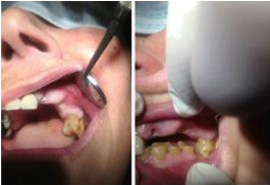
Figure 1: Pre-operative clinical pictures

Female patient, 68 years old without major systemic disease, only slight hypertension but properly controlled. She presented absence of the pieces #22, 23, 24, 25 of the upper jaw and pieces #26, 27 with periodontal disease and mobility as well as being extruded for not having antagonistic pieces for occlusion, causing a decompensated bite with clear clinical symptoms of bruxism. She reported problems with poor chewing function (Figure 1 and 2).