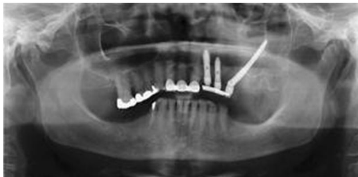
Figure 6: Post-operative radiograph

Impressions, bite registration tests and tooth color were taken for the preparation of the provisional immediate load prosthesis to be installed the same day of the implant surgery, and to do its respective postoperative radiographic record (Figure 6).