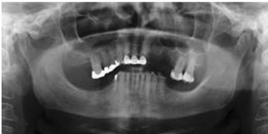
Figure 2: Pre-operative radiograph