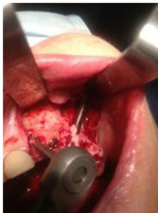
Figure 4: Clinical picture of conventional implants in #22 #23 position