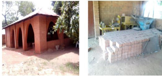
Figure 9: Picture showing perspective view of the building and internal view of workshop area

The choice of this historical building as a case study was motivated by its durability and natural aesthetical appearance. The building is currently not used for production of compressed earth bricks because of the poor maintenance of production machines. The design is aimed at producing an alternative learning and leisure environment (Figure 9).