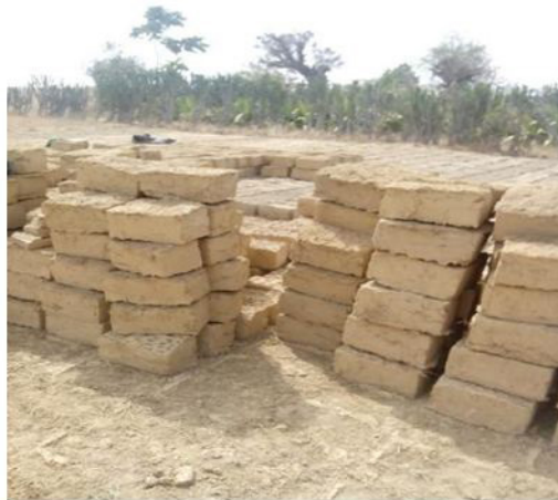
Figure 1: Picture showing adobe blocks